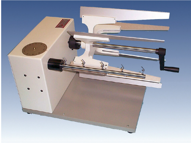
Manual Model with 5 positions